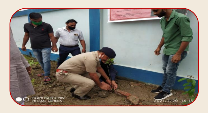
Tree Plantation by IC (Police Station)