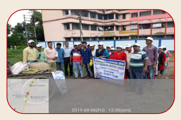
Jal Sakti Team