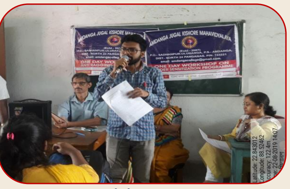
Workshop on ICC