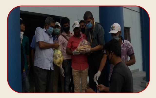
Distribution of Relief by NSS