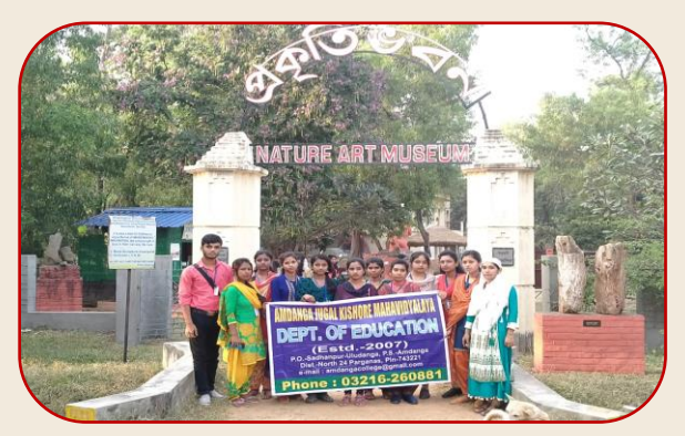
Excursion: Education Hons