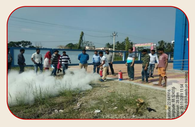
Training of Fire Extinguisher