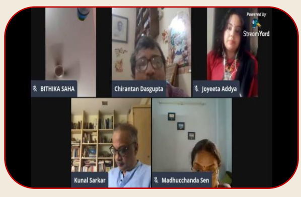
Webinar on Pandemic Situation