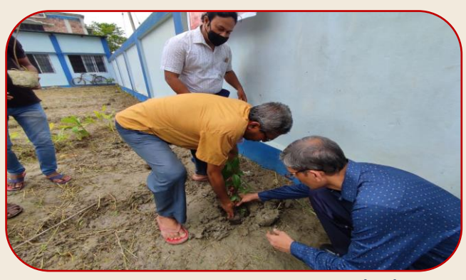
Tree Plantation by President (GB)