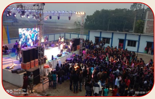
College Welcome Freshers