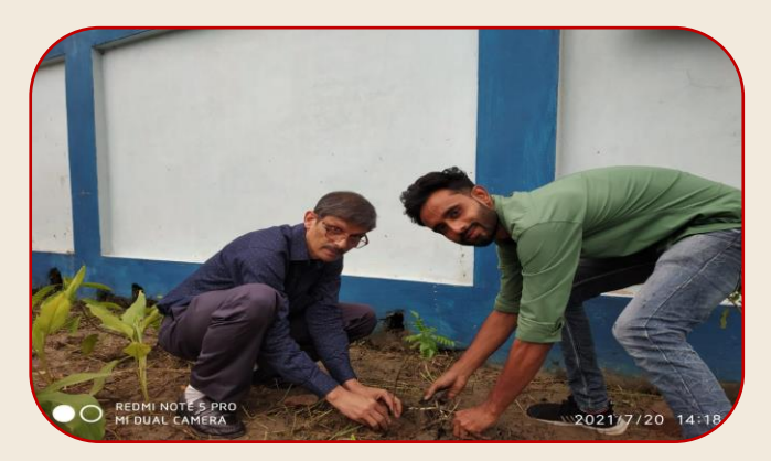
Tree Plantation by Principal