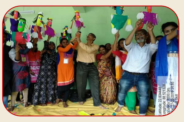
Soft Skill Development Workshop